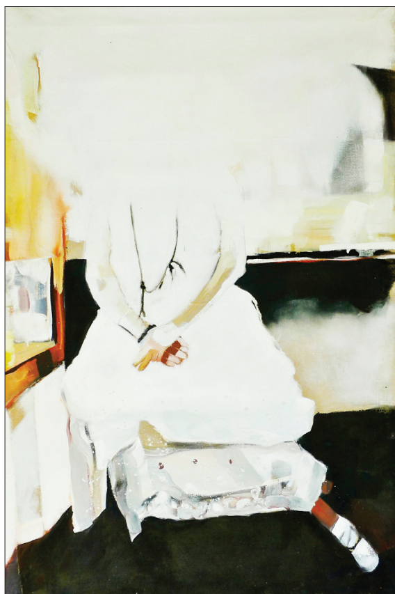
Melora Griffis, unsichtbar , 2011, oil on linen, 46" x 30".

Titled “wings and murmurs,” this show of Melora Griffis’s haunting paintings, ranging from postcard-size to more than five feet tall, was devoted mainly to portraits,