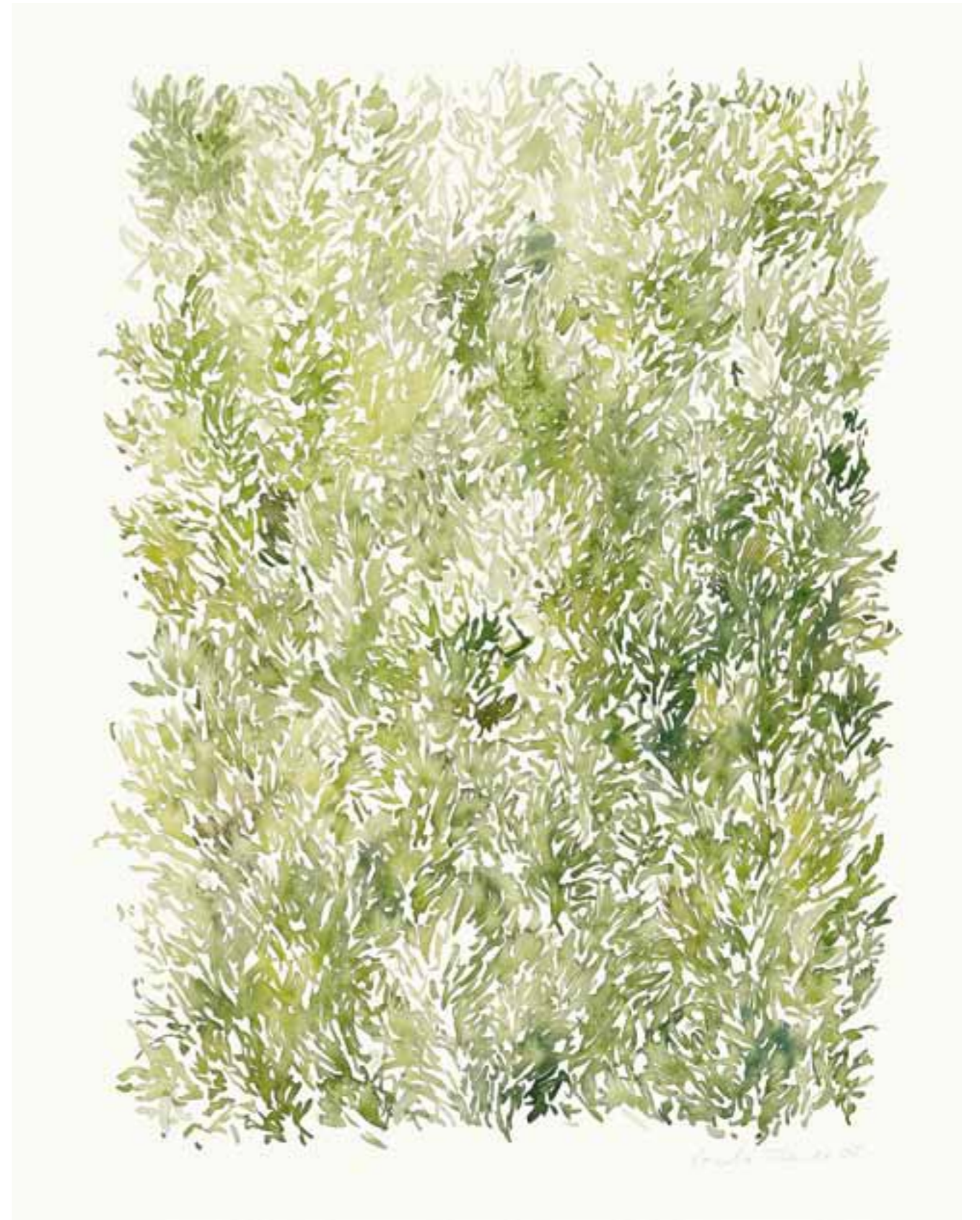
»Nr. 14-2005« Watercolor on Paper, 16" × 12½" (41 × 32 cm)