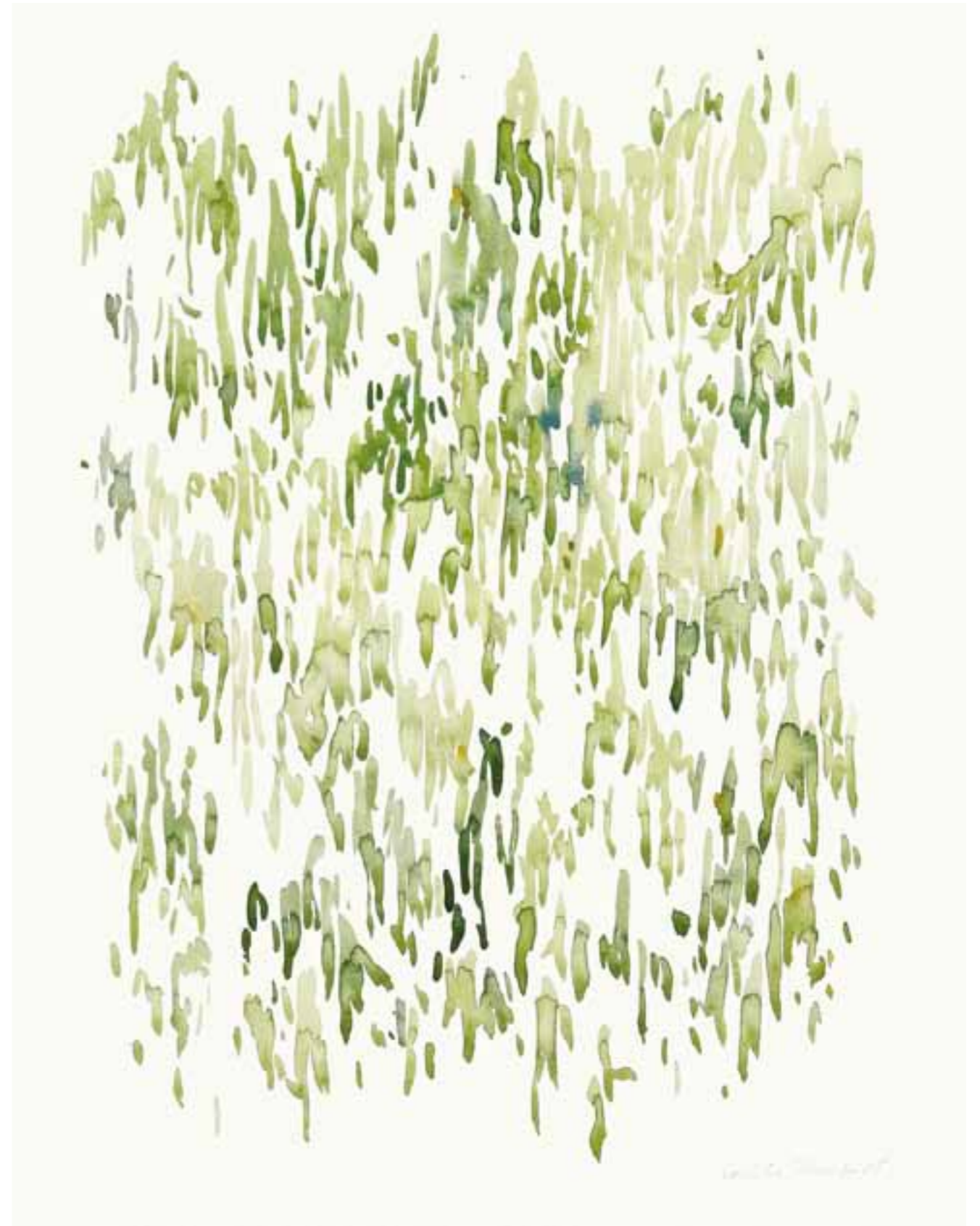
»Nr. 18-2005« Watercolor on Paper, 16" × 12½" (41 × 32 cm)