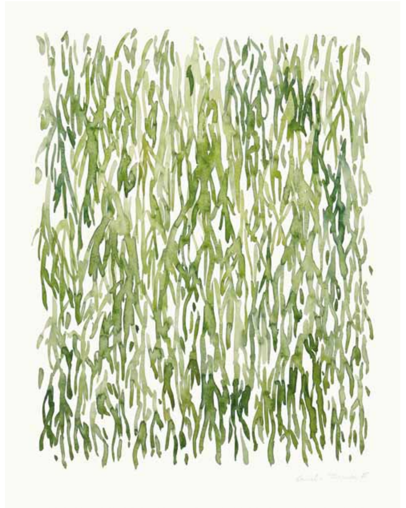
»Nr. 20-2005« Watercolor on Paper, 16" × 12½" (41 × 32 cm)