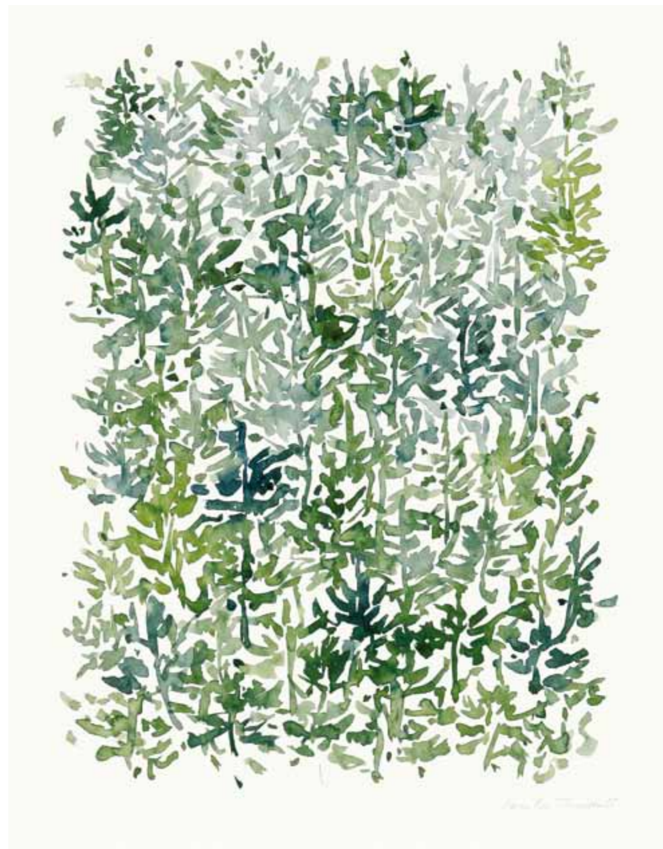
»Nr. 22-2005« Watercolor on Paper, 16" × 12½" (41 × 32 cm)